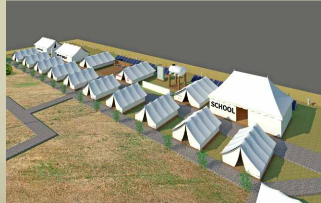
FLOOD RELIEF TENT VILLAGE